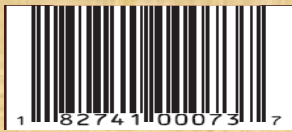
ChocoDream Dark Chocolate

Cocoa Lady Fingers- Sugar, Unbleached Wheat Flour, Eggs, Glucose-Fructose Syrup (Wheat Syrup), Leavening Agent (Ammonium Hydrogen Carbonate), Vanilla.